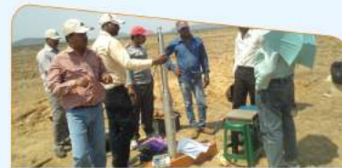
Quality Control: Geo-technical & Geo hydrological Investigation for BARC at Achutapuram Mandal, Det. : Vishakhapatnam.