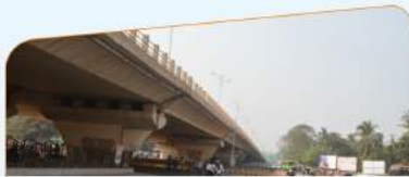
Bridge & Tunnel Engineering: Six Lane Flyover Bridge including underpass at Rajmahal Square in Bhubaneswar City. (Design Services)