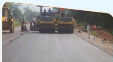
Project Management Consultancy: Naranpur- Pandapada-Harichandanpur- Brahmanipal-Duburi Road in the district of Keonjhar and Jaipur funded by MoRTH, GOI, (Length: 98km)