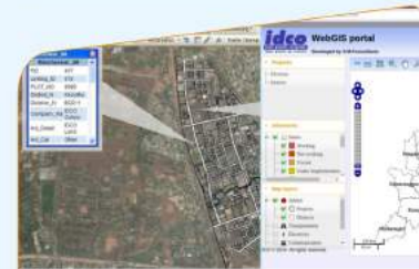
GIS & IT: Special Investment Region at Dhamra.