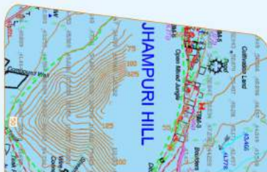
Survey: Topographical Survey in Kalinga Nagar using Total Station & DGPS.