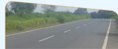
Highway Engineering: 4 laning of Sohela-Nuapada (SH-3) Length - 102 km.