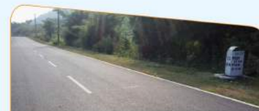
Project Management Consultancy: Authority's Engineer for Construction Supervision of Berhampur- Tamana-Chikili- Surangi-Mandarada road (SH-22) & Sheragada - Badagada -Soroda road (SH-36) on (EPC) Mode under SHDP. (Length-70Kms.)