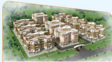
Master Planning: Group Housing Scheme over Plot No.1604 at Paikrapur, Bhubaneswar (Built up area: 2.00 Lakh Sqft.)