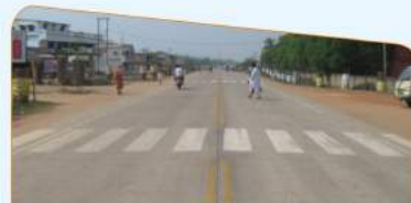
Project Management Consultancy: Two-lane rigid pavement with 1.5mtr paved shoulder on both sides to Cuttack-Paradeep road (SH-12) (Length: 82 km)