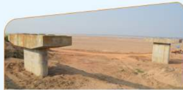
Bridge & Tunnel Engineering: HL Bridge over River Kathajodi for direct link from Cuttack city to Bhubaneswar (Length-2.81Km.) (Design Services)