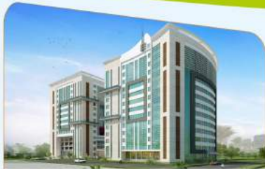
Architecture & Structural Design: Construction of IT Incubation Centre, Bhubaneswar, Odisha, (Built-up Area 4.35 Lakh Sqft.) (Design & PMC)