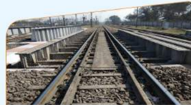
Railway Engineering: Final Location Survey, Geotechnical Studies, Design, Preparation of Drawings & Other Preliminary activities in connection with Construction of New BG Line between Durgapur-Katlam via Banswara (176.47 km).